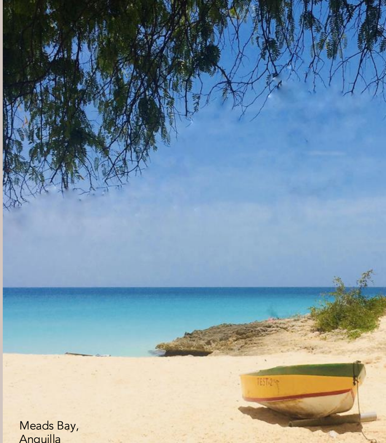
Meads Bay, Anguilla